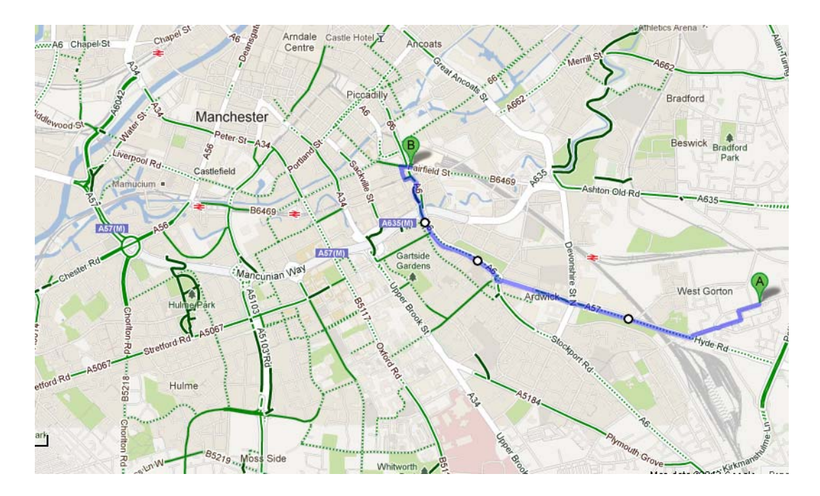
Figure 1- Wenlock Way in closeness to Manchester City Centre and local rail stations and cycle routes.

4.7 The new development will provide secure cycle parking in line with current design standards (GMP Design for Security Cycle Parking Design Guidance) and will have a cycle friendly infrastructure throughout the site. On site there will be a dry changing facility with one shower per ten secure bike parking spaces located within. There will be lockers for staff that will be made available upon request to the Travel Plan Coordinator. In total 50 bike parking spaces will be developed, all of which will be protected by 24 hour CCTV surveillance.